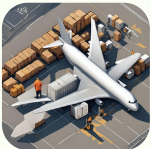
Air Freight Forwarding