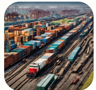
Rail Freight Forwarding