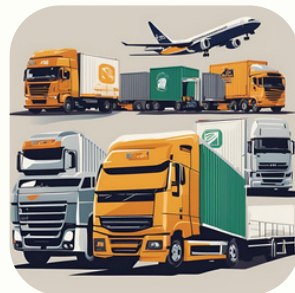
Road Freight Forwarding