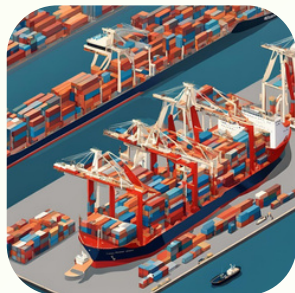
Sea Freight Forwarding